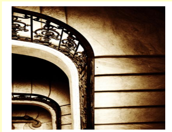
The Renaissance School Psychologist

Please see room descriptions on the resorts website: www.seapalms.com